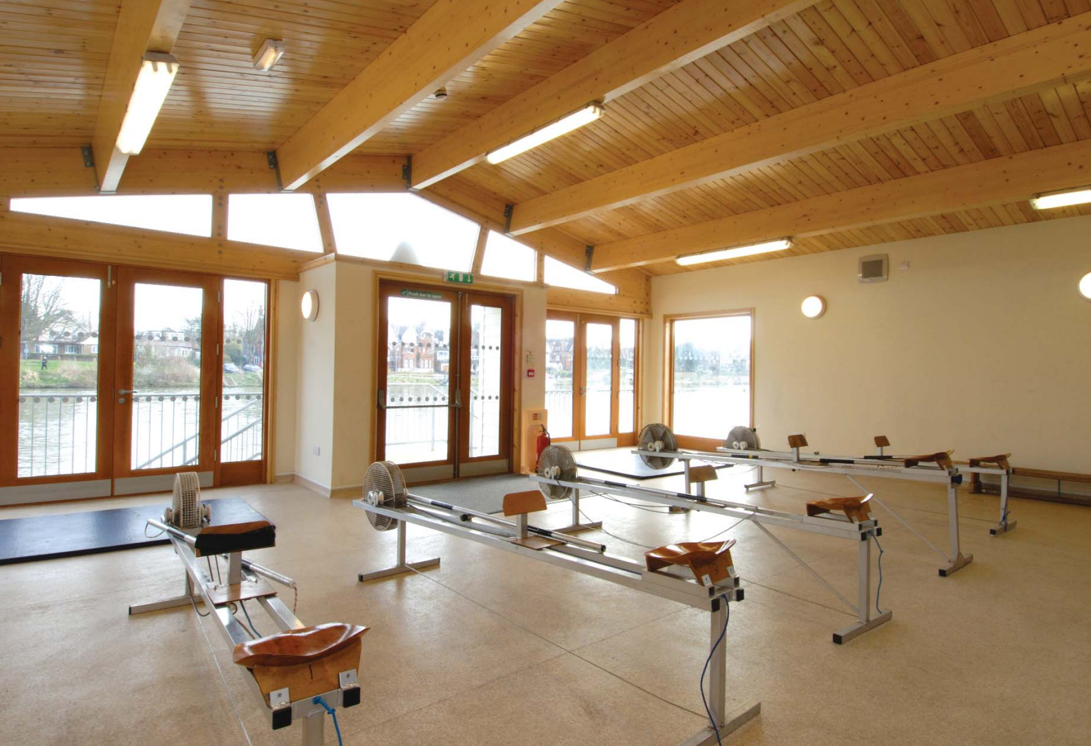
The coaching and workout room.