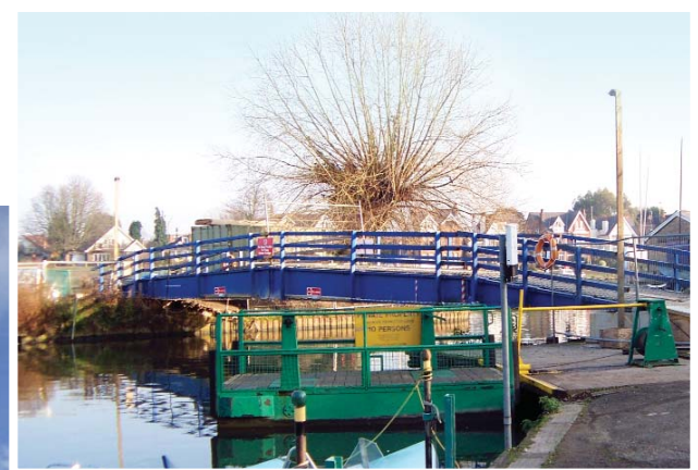
The temporary bridge and hand-wound chain ferry.